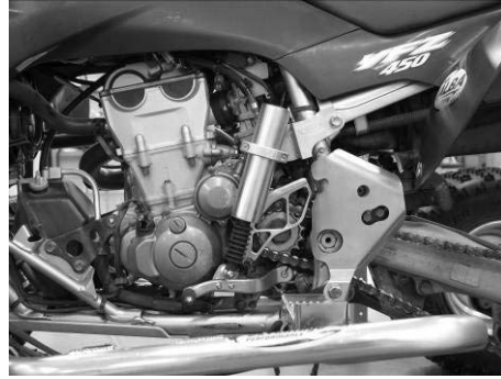
2005 Yamaha YFZ450