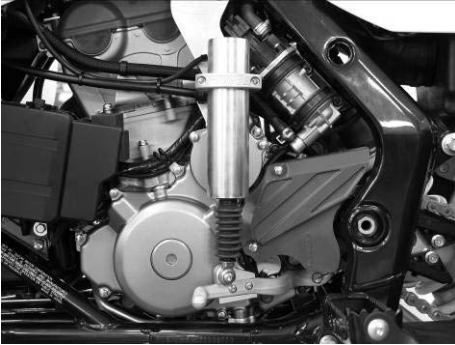
2007 Suzuki LTR450