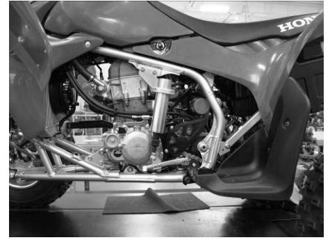
2008 Honda TRX450R

Dear Valued Customer, Pingel Enterprise, Inc. would like to take this opportunity to thank you for purchasing one of our All Electric Speed Shifter Kits. We would also like to know what you think of the product and how your installation went. Your assistance can help us overcome any technical issues that other installers may experience. You can reach us toll free at 1-888-474-6435 or email us at info@pingelonline.com . We are also requesting photos of your installation. Your photos may be selected for publication in the Pingel catalog or at www.pingelonline.com . Photos may be submitted by emailing them to info@pingelonline.com . When submitting a photo, please include the motorcycle model and year. Thank you again for your purchase!